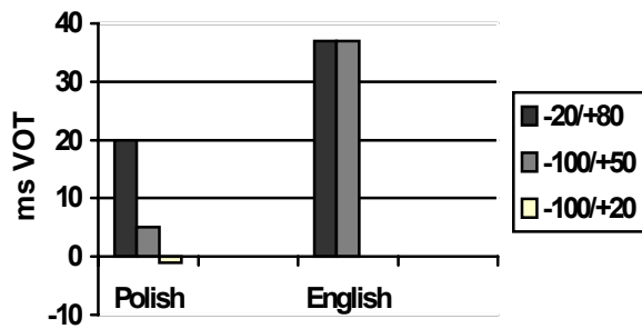
Figure 1: Mean calculated category boundaries for 20 Polish and 20 English listeners, for three VOT continua with different ranges (-20 ms to +80 ms, -100 ms to +50 ms, -100 ms to +20 ms)

I concluded that the aspiration contrast was perceptually easier and hence more “stable” than the voicing contrast. In that case, there must be some compensating advantage of the voicing contrast. I suggested that the advantage lay in its ease and stability in production, in that because speakers only had to turn on voicing sometime during closure, vs. not at all, the timing control needed was simpler than in an aspiration contrast. To some extent this was still a claim about perception, in that variations in timing of voicing would produce differences that wouldn’t matter in the perception of this contrast. But it was seen even in production data that the VOT distributions for voiced vs. voiceless stops were clearly separated even across contexts and speaking conditions. Figure 2 from [9] shows one piece of this picture: the clear separation of the VOTs of voiced and voiceless stops in one set of data from Polish.